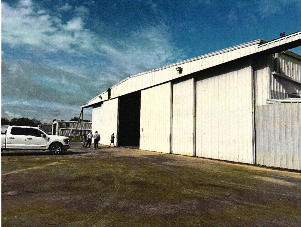
Additional Picture of Hangar