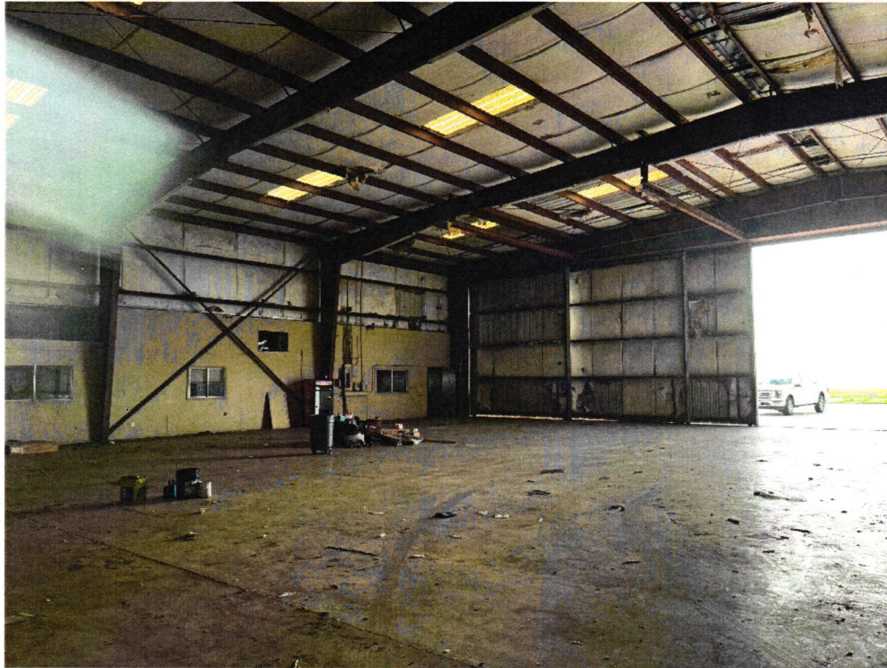
Additional Picture of Hangar