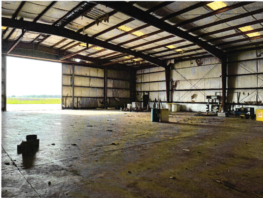
Additional Picture of Hangar