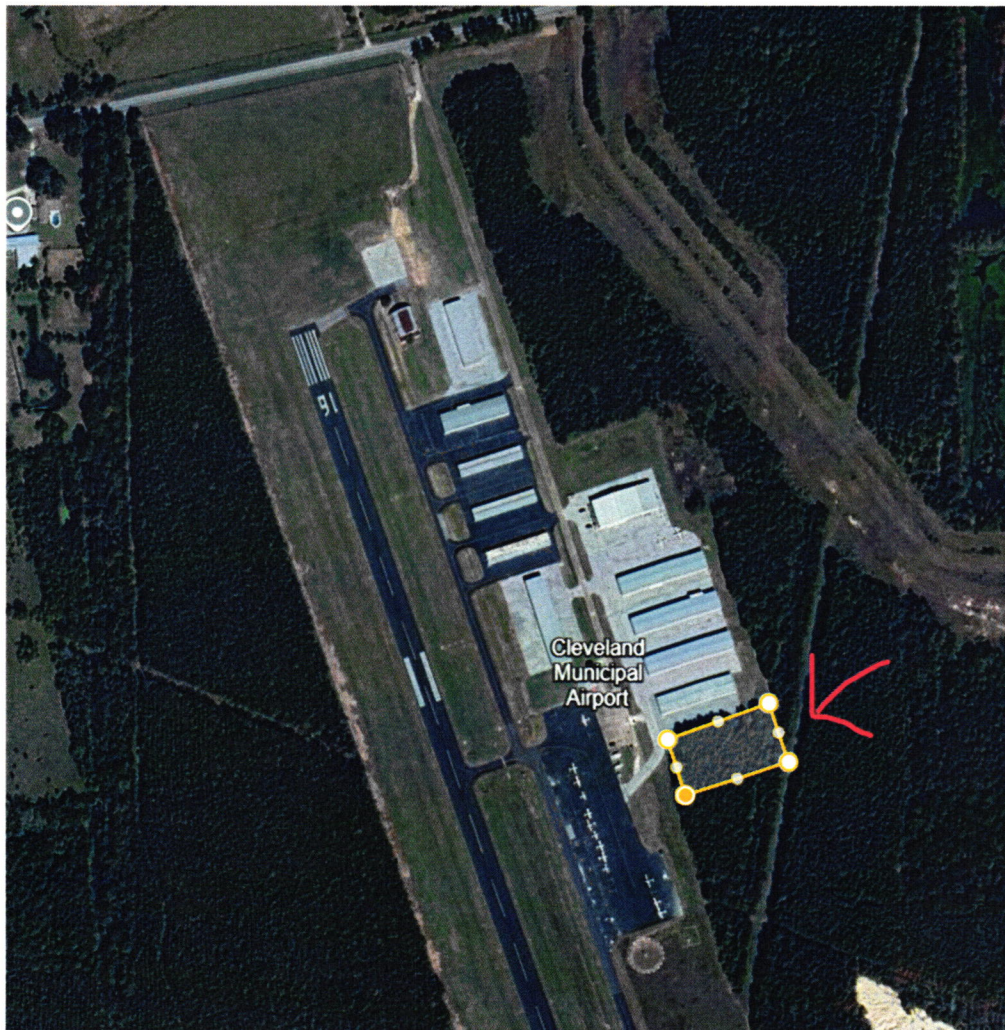
Designated location at 6R3