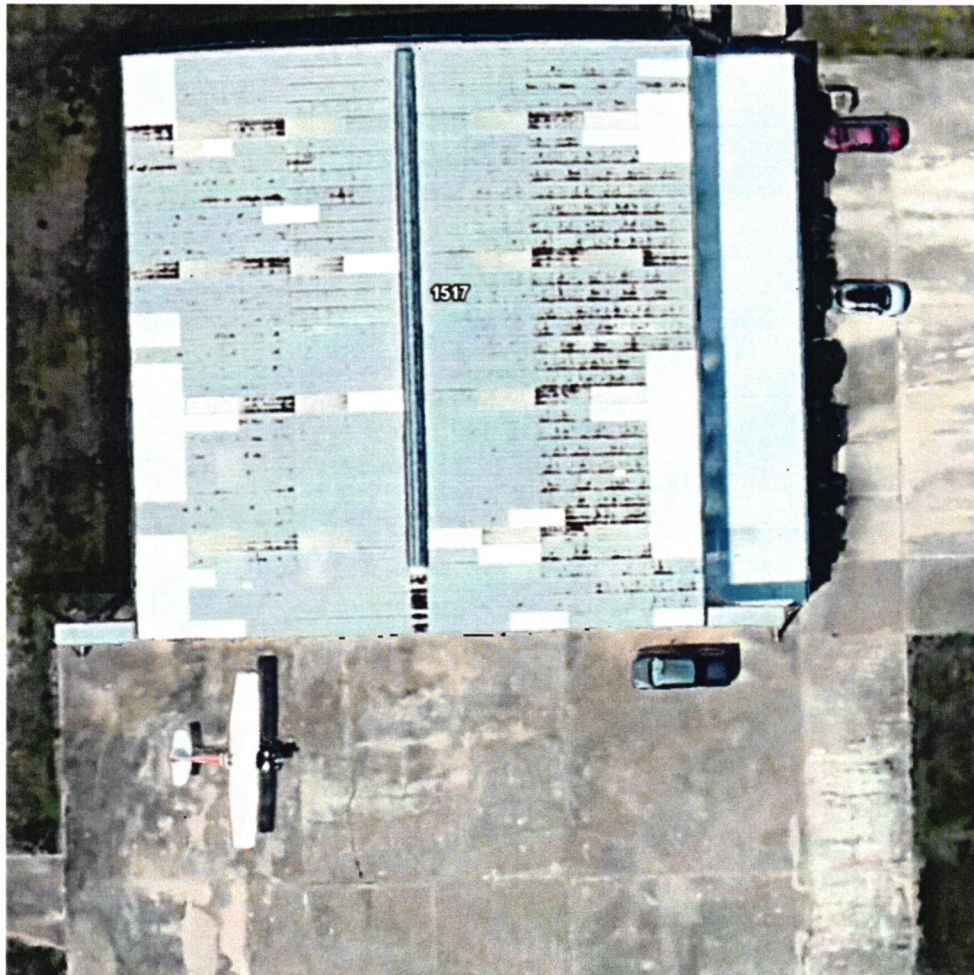
Overview of Hangar at Sugarland Regional Airport