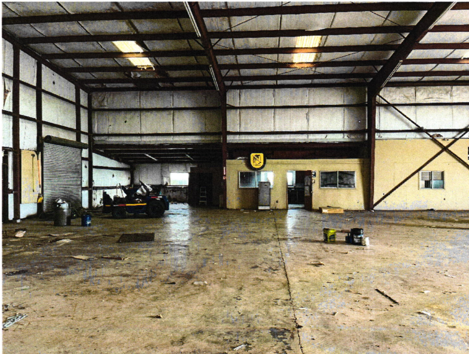
Additional Picture of Hangar