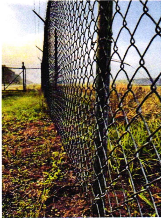
c. Example image of current airport fence