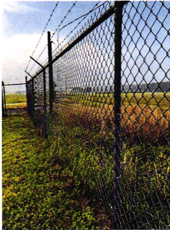
a. Example image of current airport fence