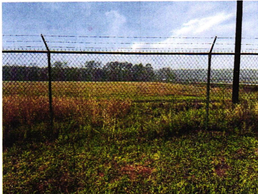
b. Example image of current airport fence